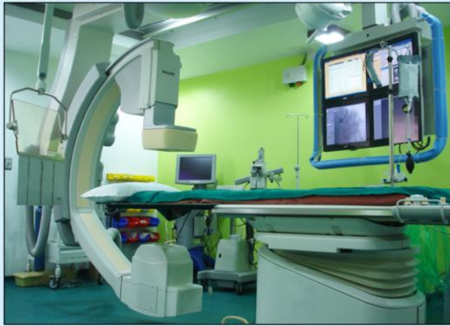
The world's fastest angiography machine is at CIMS with stent boost technology for best Angioplasty results